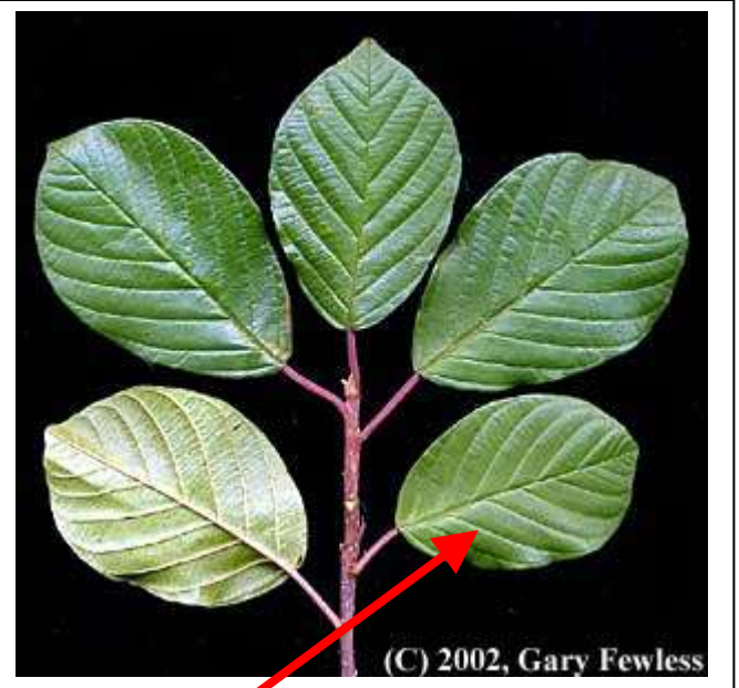
Glossy Buckthorn (wet areas)

Similar to Common Buckthorn, leaves extremely glossy with deep veins and leaf margin is smooth, without teeth